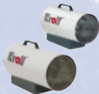
Gas-fired heaters For instant and efficient heat. Also available in stainless steel. Rated heating power 10 to 142 kW