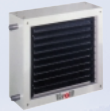
Air heaters Highly suitable to complete existing central heatings. For installation at ceiling and wall. Rated heating power 6 to 100 kW