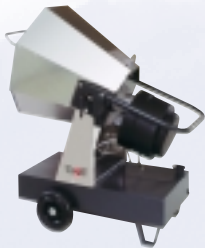
Infra-red oil heaters IR 33 Radiant heat without dust. Rated heating power 33 kW