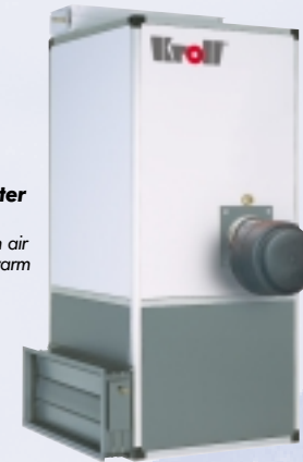
Stationary warm water and air heaters For the generation of warm air for direct heating and/or warm water that can be used for heating systems. Rated heating power 30 to 80 kW