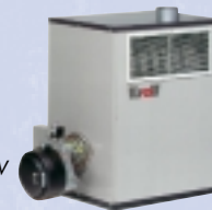
Wall-mounted warm air heaters For workshops and storerooms, very space-saving. Rated heating power 22 to 69 kW