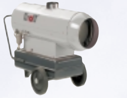
Oil-fired space heaters, with flue For use in closed rooms. Rated heating power 25 to 75 kW