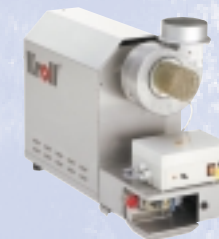
Warm air heaters for agricultural use Made of stainless steel, for natural and liquid gas. Rated heating power 8 to 50 kW