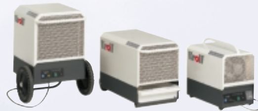
Dehumidifiers For efficient drying and keeping dry. Extraction 20 l to 120 l/24 h