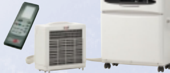
Mobile air conditioners Instantly ready for operation. Cooling power 3 to 4,7 kW