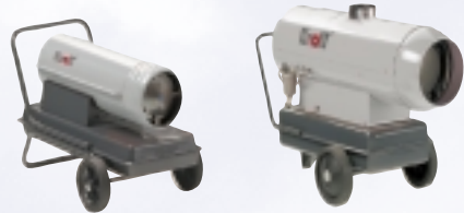
Oil-fired space heaters, without flue For use in well ventilated rooms or in the open air. 100 % of the energy is converted into heat. Rated heating power 25 to 80 kW