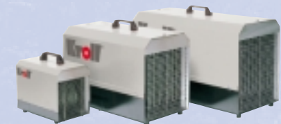
Electric fan heaters For small and medium-sized rooms, also as additional heating source. Rated heating power 3 to 18 kW