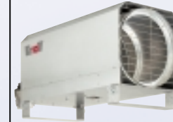
Gas-fired heaters To be installed on the ceiling: highly suitable for horticulture because of carbon dioxide. Rated heating power 60 to 100 kW