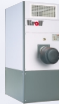
Stationary warm air heaters Powerful gadget for halls of all kinds of sizes. Rated heating power 20 to 652 kW