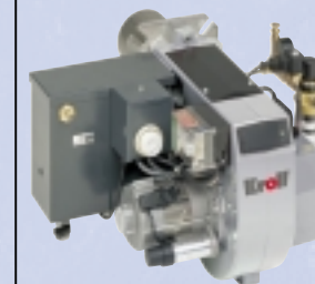
Multi fuel oil burners For vegetable, animal and conventional oil. Rated heating power (depends on fuel) 28 to 195 kW