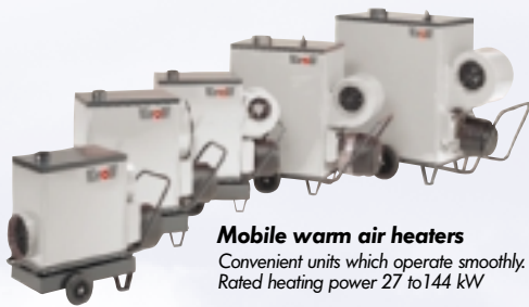
Mobile warm air heaters Convenient units which operate smoothly. Rated heating power 27 to 144 kW