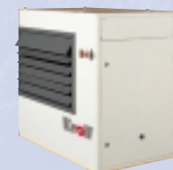
Atmospheric warm air heaters For the heating of halls, efficiency over 90 %. Rated heating power 24 to 75 kW