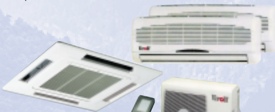
Stationary air conditioners For installation at ceiling and wall, also for several rooms. Cooling power 2 to 7 kW