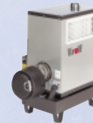
Stationary warm air heaters SL Completely equipped for immediate heating. Rated heating power 35 to 69 kW