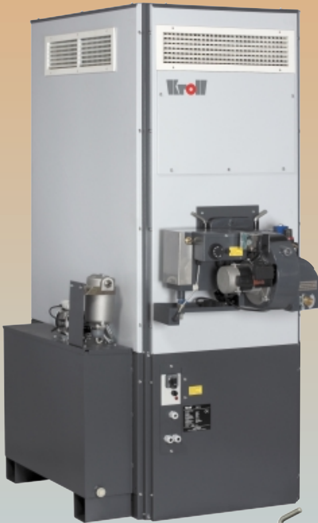
"SZ" Warm Air Heater, with day tank