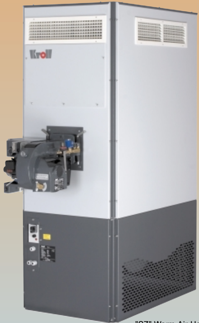
"SZ" Warm Air Heater, without day tank